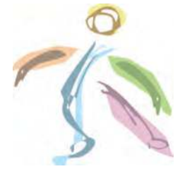
Skatang Tribe and Tainan Community University